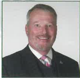
Buddy Dyer Mayor, City of Orlando